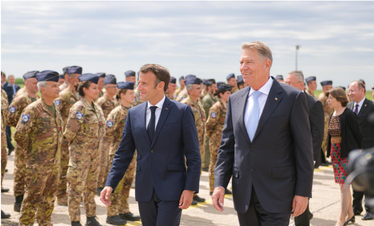
Fig. 4. French President Emmanuel Macron and Romanian President Klaus Iohannis visit the Mihail Kogălniceanu Airbase in Romania, June 15th, 2022.