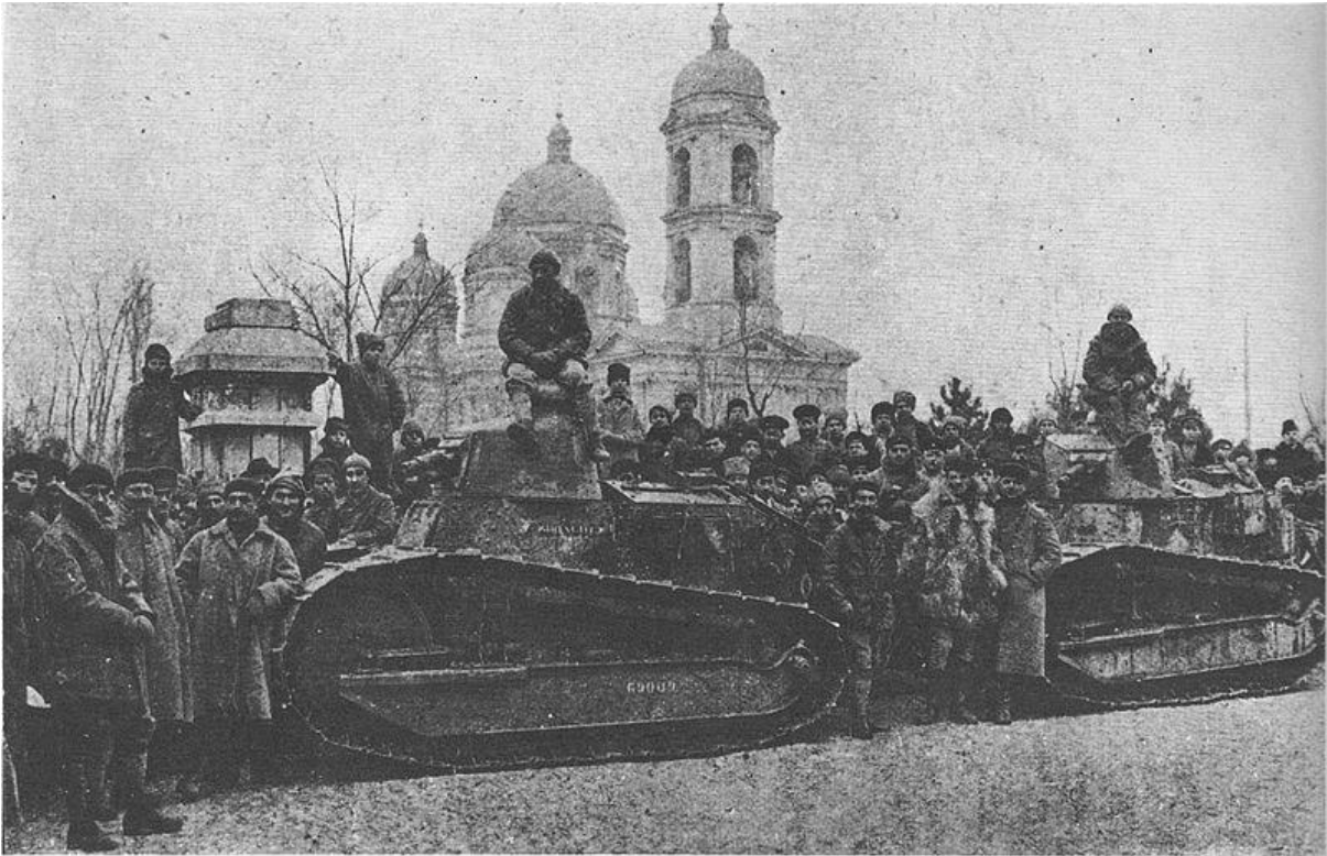
Fig. 3. Renault tanks with French soldiers mixed with civilians and White Army soldiers during the military intervention in the Black Sea in 1919.

Türkiye also has significant reserves of natural gas in its Black Sea EEZ, which it aims to start exploiting in the near future, possibly as soon as 2023. 45