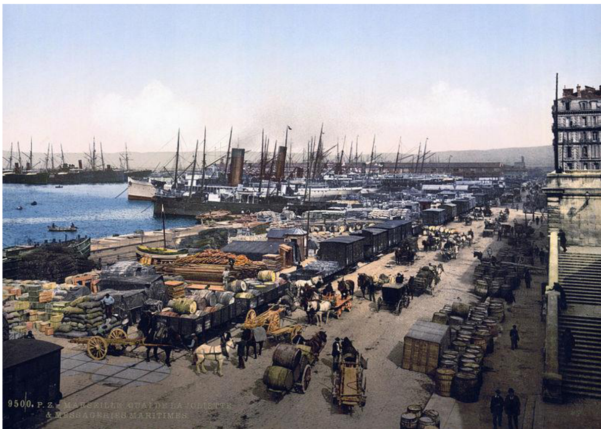
Fig. 1. Quai de la Joliette, Marseille, 1890.

In the final address of his book “Marseille the gate of the South”, written in 1927, French journalist Albert Londres called on French elites to embrace the seas and open up to the world. Beyond the ugly reality of colonial mindset depicted in the book, these final remarks are reminiscent of a thought that seems to have transcended ages, and that finds its best expression in a quote attributed to the Cardinal de Richelieu: “the tears of our sovereigns taste like the salt of the sea they ignored”.